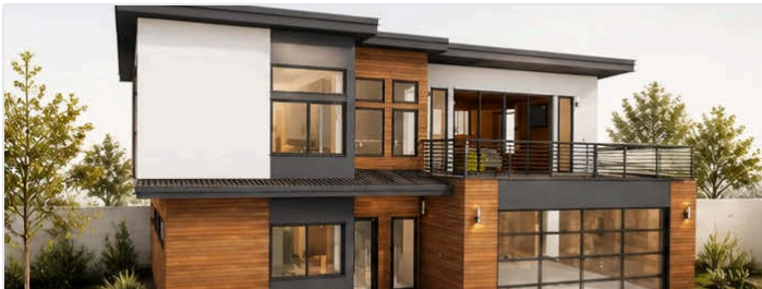
① FRONT LEFT

Four exterior perspectives · cedar siding · standing-seam metal roof · glass garage door