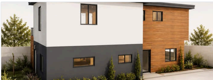
③ BACK LEFT