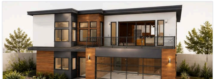
② FRONT RIGHT