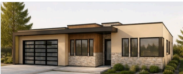
① FRONT RIGHT

Architectural perspectives · all four corners shown · alternate color schemes available on request