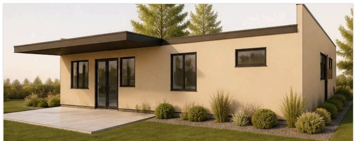
④ BACK LEFT