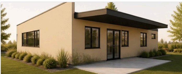
③ BACK RIGHT