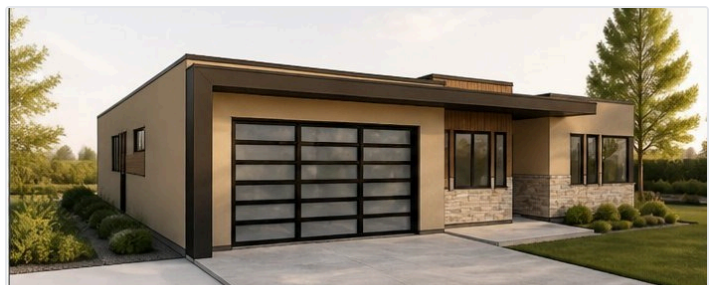
② FRONT LEFT