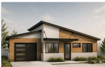
① FRONT LEFT

Two 3D perspective views and two architectural elevation drawings