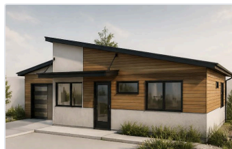
② FRONT RIGHT