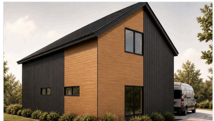
② REAR CORNER