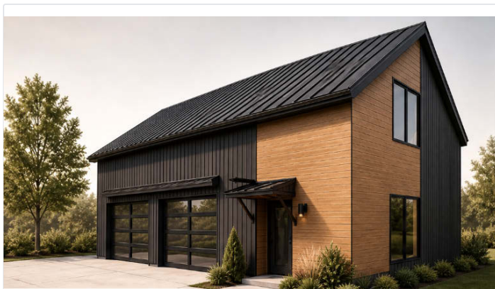
① FRONT CORNER

Architectural renderings · dark metal + warm cedar scheme